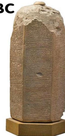
Prism of Esarhaddon